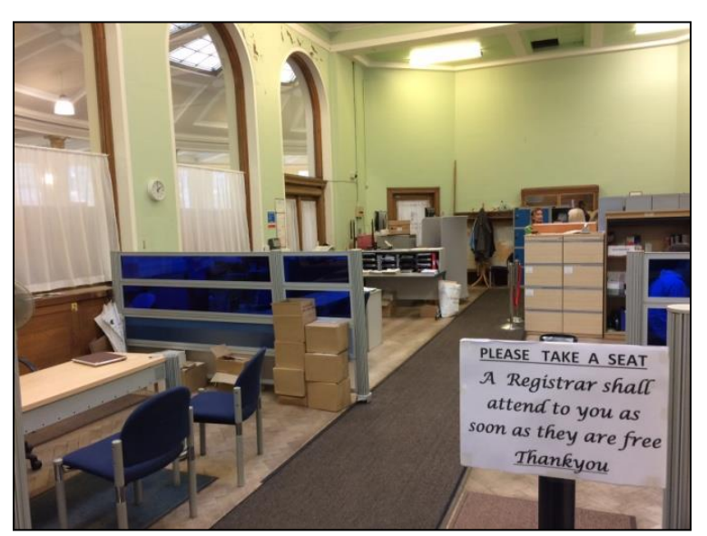
2 - Open plan Registrar office with staff accommodation to rear