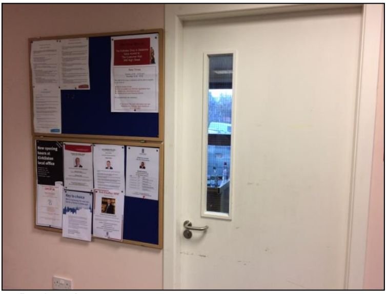
3 - Registrar's room