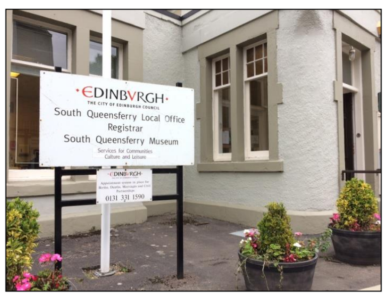
2 - Front door to shared accommodation