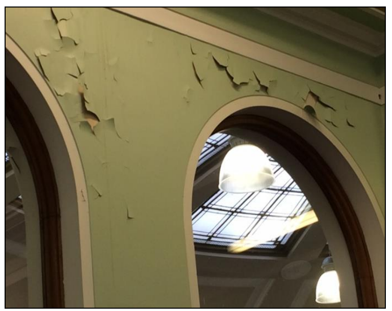
3 - Paint peeling from walls and ceiling