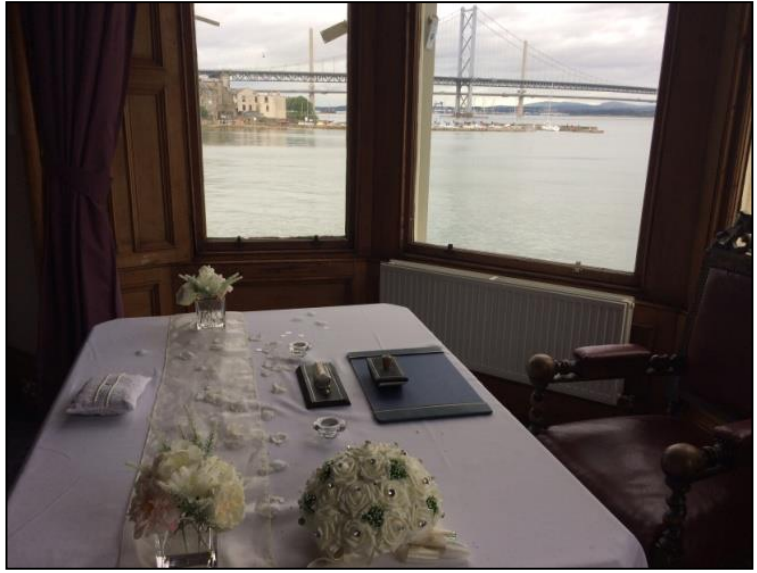
3 - Marriage suite with views across three bridges on the River Forth