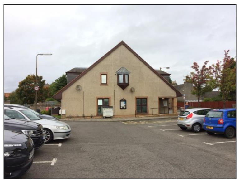
1 - Location photo