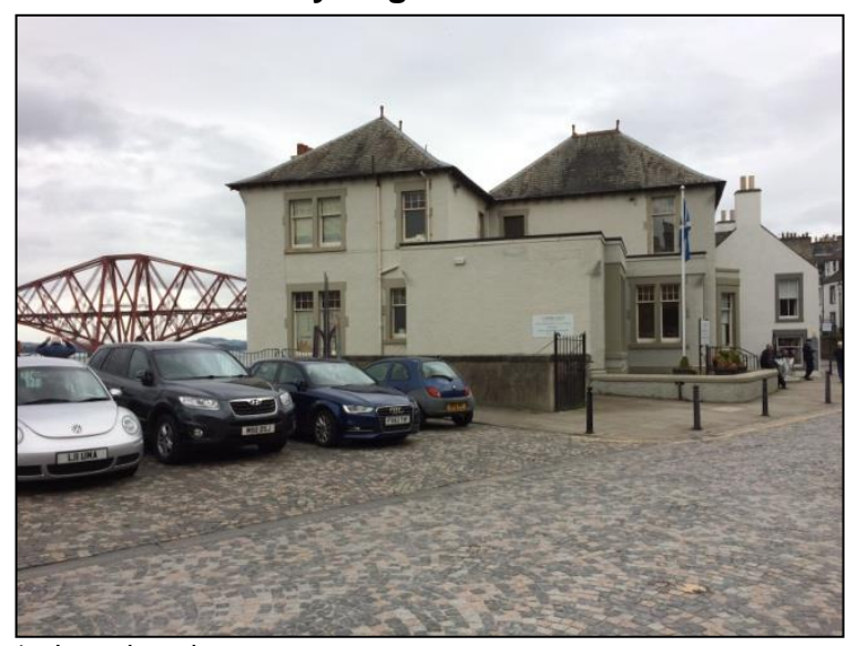
1 - Location photo