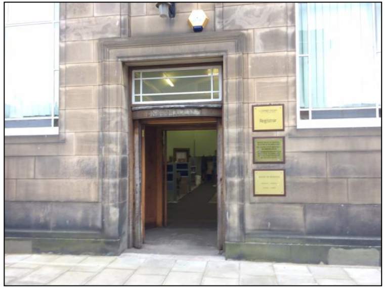
1 - Front door – side entrance of library